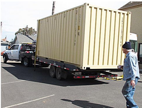
The 8'x20' container arrived last week. A group of Trustees and Sunshine volunteers were on hand to watch the arrival