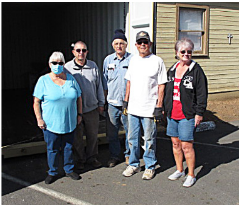
The group could hardly wait to see what the interior looked like! They were pleased that the color of the exterior of the container matched the color of the church office building.