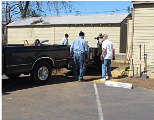
A group of Trustees gathered a few weeks back to prepare a pad for the container