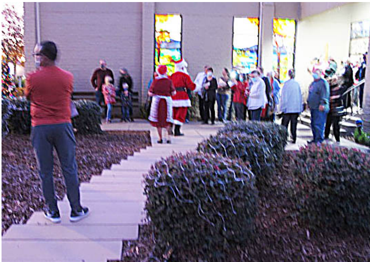
Following the program, Santa and Mrs. Claus lead the congregation to the front courtyard for a lighting of the night ceremony.