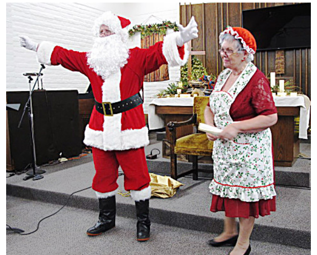
Santa and Mrs. Claus made a surprise visit with gifts for the children