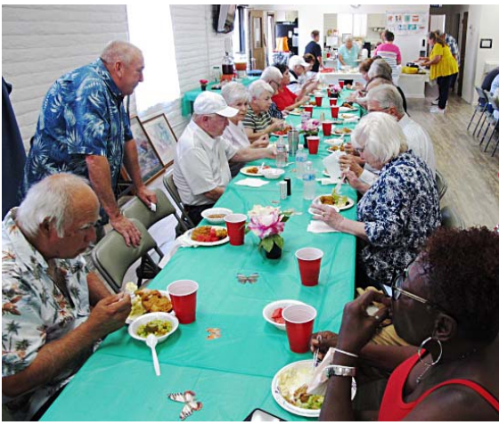
We had a few door prizes